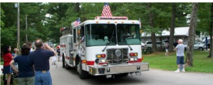
A Belle Plaine fire truck leads the Fourth of July Kiddie Parade.