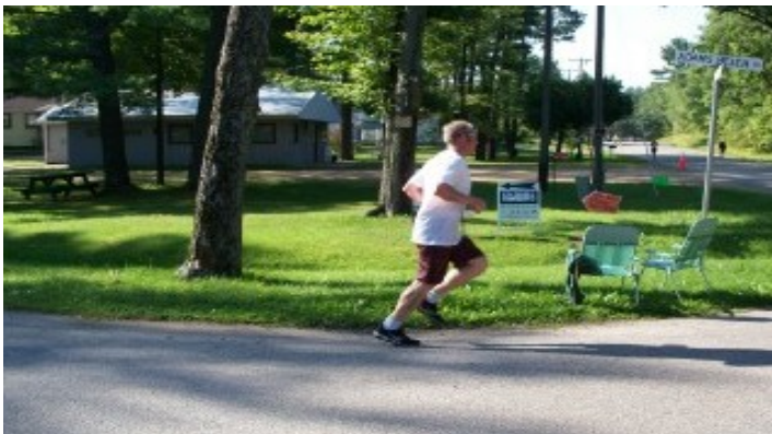
A runner rounds a corner and turns onto Highway Y during the third annual Tri Cloverleaf Lakes Triathlon.

The number of athletes who competed in the third annual Tri Cloverleaf Lakes Triathlon grew by 50 percent this year, with more than 150 participating on Sept. 5.